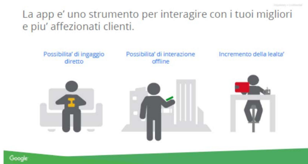
Figure 5 - Extract from the presentation entitled "Enel X & Google. Ideas for Enel X Recharge".